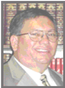
Preacher/Elder Mountain City Church of Christ Mountain City, Tennessee