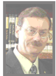
Minister/Elder Cuba Avenue Church of Christ Alamogordo, New Mexico

ContendingFTF@yahoogroups.com www.zianet.com/maxey/pattern.htm churchesofchrist.com